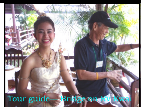
Tour guide – Brisbane Australia

be considered especially if you are travelling independently or on a budget and easily prebooked.